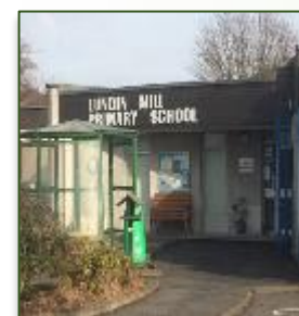
Lundin Mill Primary School