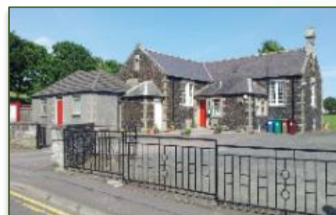
The Durham Hall