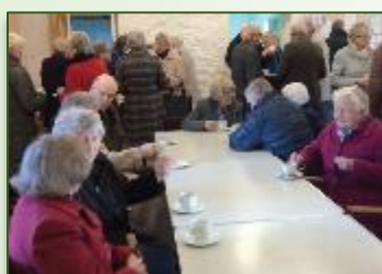
Coffee after church in The Stables