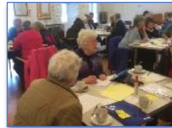
The Elders Conference: Jan 2018

What do we think pastoral care is? We regard it as caring for those in the congregation and parish. As individuals within a congregation we all have a role in pastoral care, reaching out to the housebound and those requiring some support at difficult times. The group meets to plan how to operate and provide a consistent service in the parish, and it is acknowledged that we be proactive in providing that pastoral care for the families of the parish.