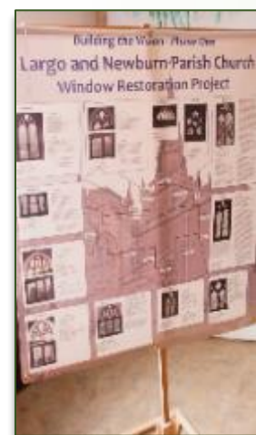
Stained Glass Window Restoration 2017