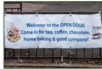
The Open Door – in the Durham Hall

The Stables is also used by groups not associated with the church; Mums and Tots, country dancing and two sewing classes meet weekly. Community Council meetings take place occasionally. Largo Cricket Club uses the facilities regularly at weekends and occasionally during the week during the season. (See Church website www.largochurches.org.uk )