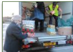
Blythswood Shoe Box Appeal