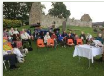
Mid Summer Service: June 2017