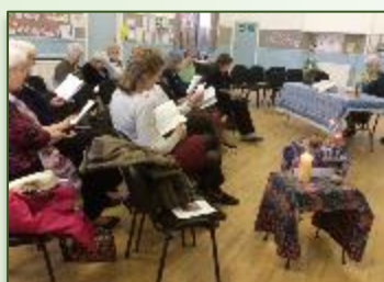
World Day of Prayer: March 2017