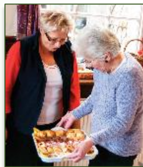
Community Coffee Morning – Spoiled for Choice!