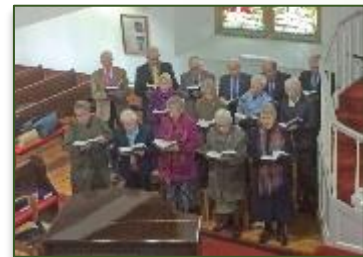
Largo Parish Church Choir

Cluster services are held at Advent/Christmas and Easter where we can learn from each other and make new friends. A printed order of service is issued every Sunday with information on forthcoming events. Recording of services: The production of CDs and their distribution to housebound members is important for the housebound to retain a link with their church and Christian faith.