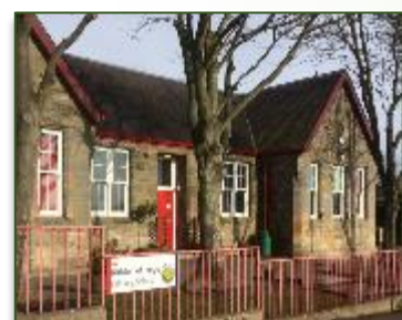
Kirkton of Largo Primary