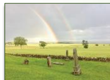
Mid Summer Service: June 2017