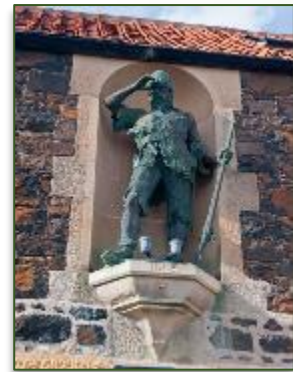
Robinson Crusoe: Lower Largo

There is a small cluster of shops in Lundin Links, Upper and Lower Largo. More comprehensive facilities are available in Leven, St Andrews, Cupar and Kirkcaldy. Bus services provide links along the East Neuk coast and to St Andrews, Leven and via Kirkcaldy to Edinburgh. Train stations are located in Markinch, Kirkcaldy and Cupar.