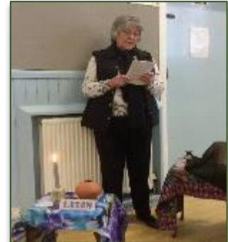
World Day of Prayer