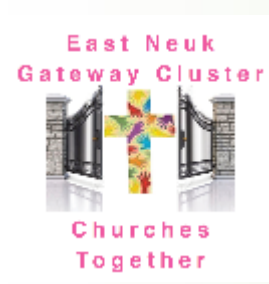
East Neuk West Cluster