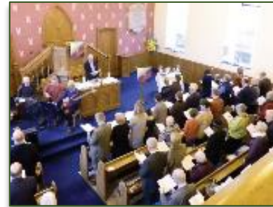
Service of Celebration: St Davids Jan 2018

All Services are held in Largo Parish Church, apart from the last Sunday in the month when the Durham Hall is used, offering the opportunity to try a more modern and relaxed approach to worship. All services are at 10.30am