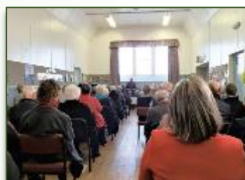
Worship in the Durham Hall: Feb 2018