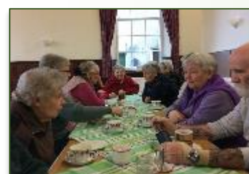
Drop In – The Simpson Institute