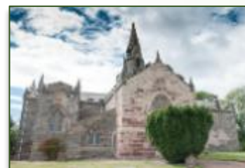
Largo Church Restoration 2017