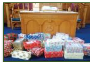
Blythswood Shoe Box Appeal

Emergency Appeals: We try to support any world crisis such as Build a House Appeal, after the devastating earthquake in Nepal.