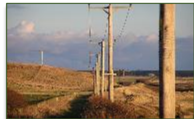
Fife Coastal Path