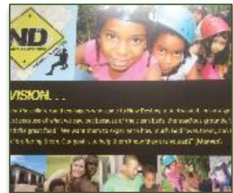
New Destiny - Brazil