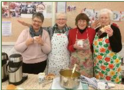
Happy New Year 2017 with Bacon Butties