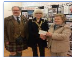
Order of St John: Dec 2017

The Guild: The Guild meets in the Durham Hall, fortnightly, during the winter months. There is a seasonal programme of activities and speakers. The Guild also runs a series of several coffee mornings in the summer. Held in the Durham Hall, these are well attended by the local community and summer visitors.