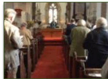
First Service as Largo Parish Church: Jan 2018

The Kirk Session of the congregation operates under the Unitary Constitution and is committed to working together to reach out to our community as effectively as possible.