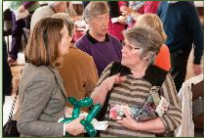
Community Coffee Morning