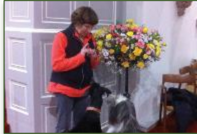
Arranging flowers with Help!